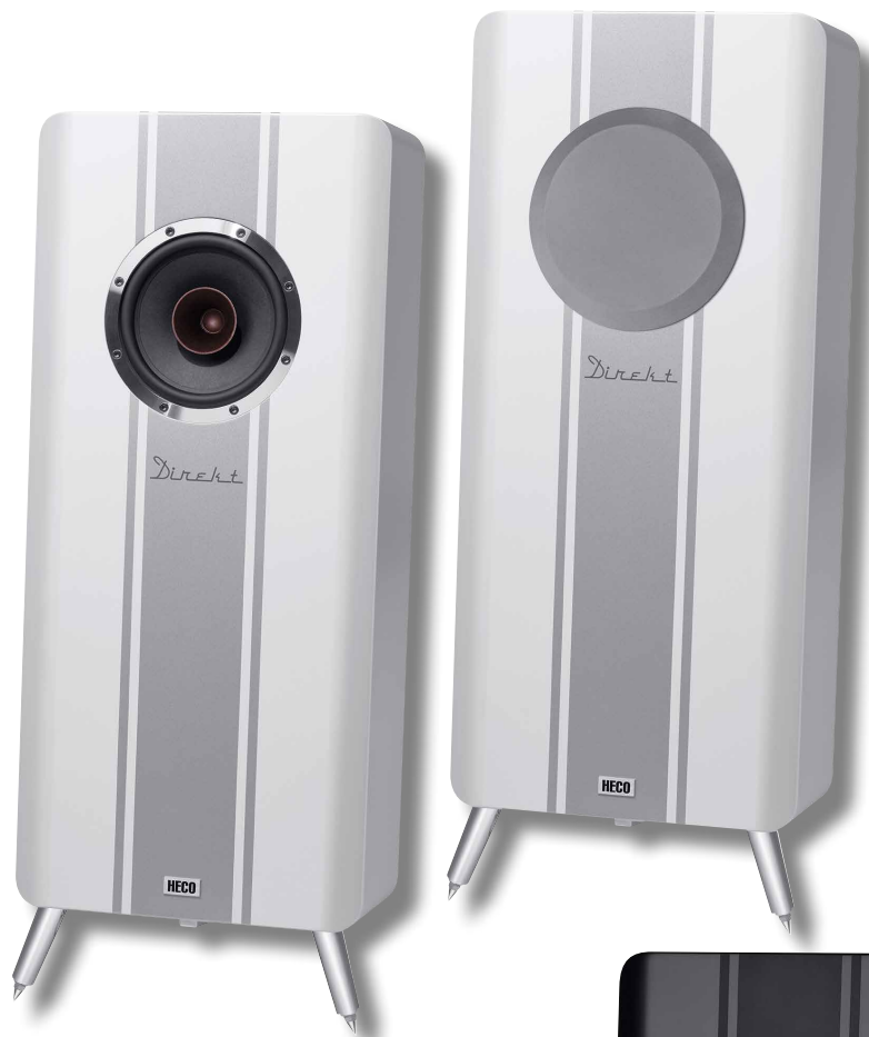
White & Silver