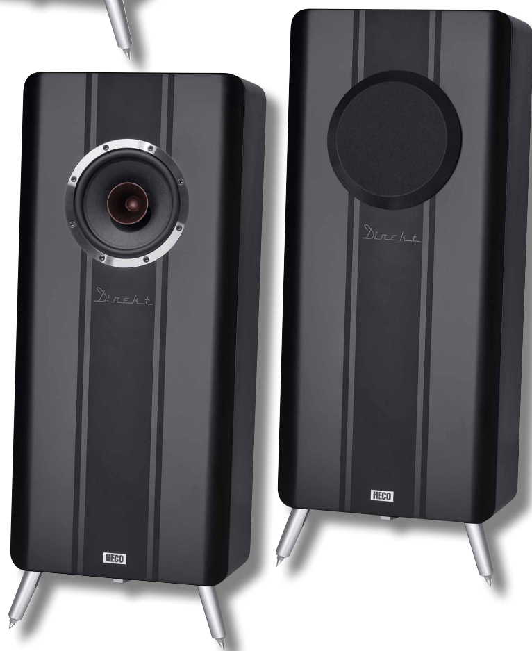
Black & Black